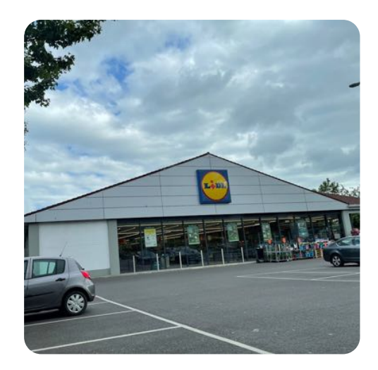
Lidl London Road DEVIZES - Your nearest Lidl!